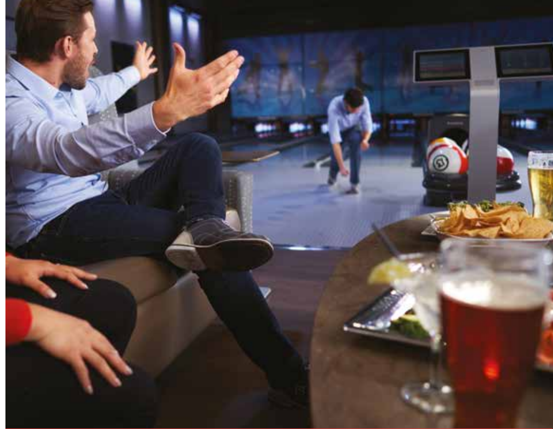
Restaurants & Bar