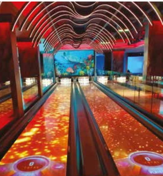
Hotels & Resorts