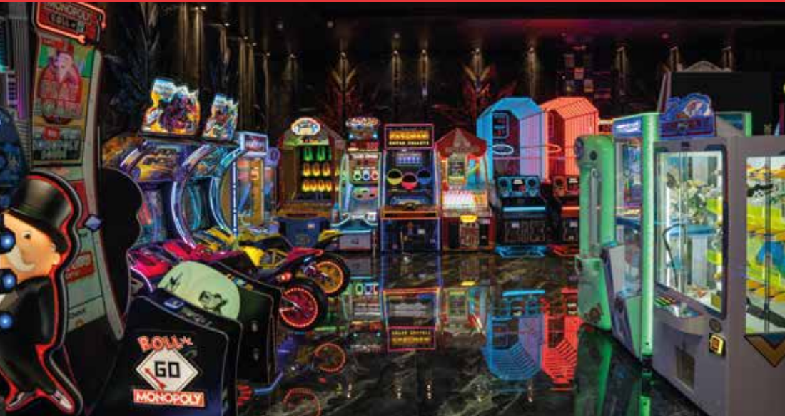
Family Entertainment Centre

Let's bring fun to your location. No matter how big or small.