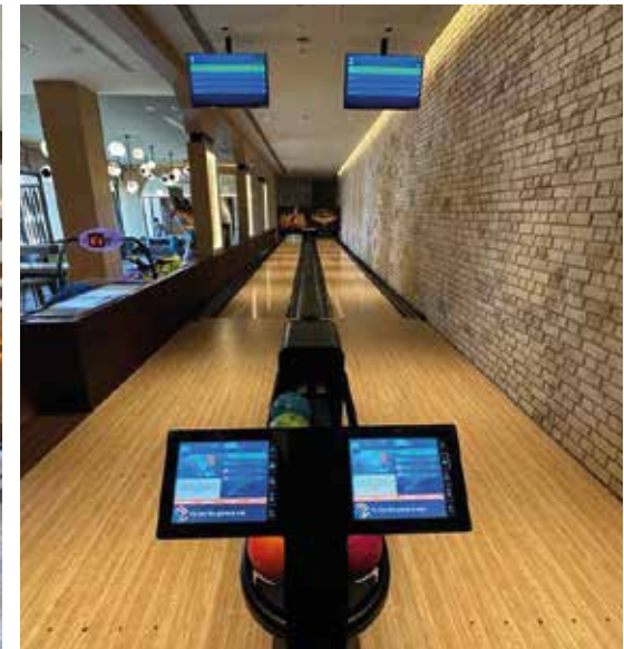
Club House & Condominiums